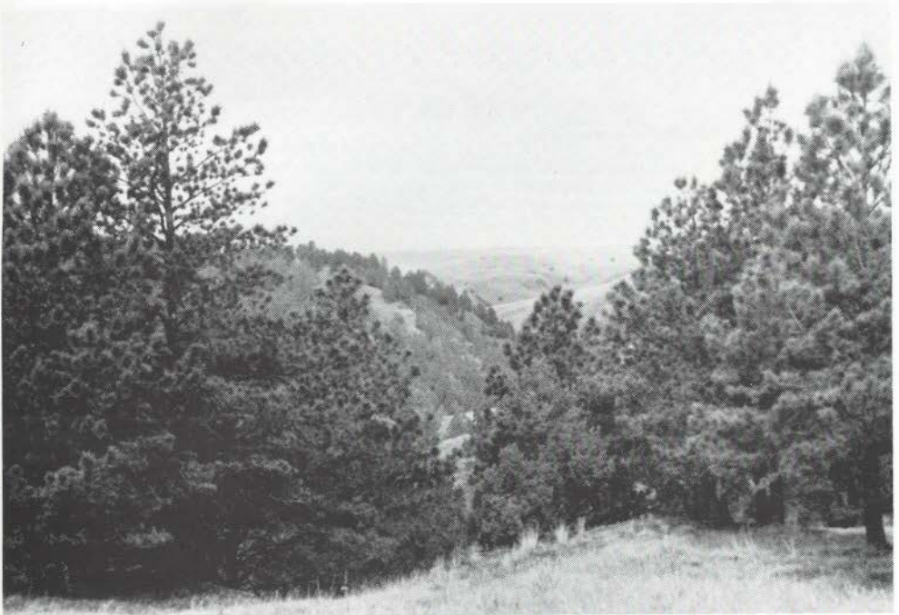
Figure 1. A pine-lined canyon near White Owl, Meade Co., South Dakota. A photograph of an overview of the same canyon appears on page 55.

The camp, at about 2700 ft above sea level, looked over steep cliff faces and draws that led to Badlands Creek and eventually to the Belle Fourche River (at about 2200 ft). Along the upper ridges of the canyons and cliffs grew a sparse ring of Ponderosa Pine forest (see Fig. 1), which, at lower elevations, quickly gave way to cedar on the hillsides and cottonwood in the river bottoms. In the upper reaches of steep east/west canyons, several pockets of aspen were also discovered. The major aspen grove we found, located about 1 mi N camp, contained over 100 aspens, the taller trees averaging 40 ft. The forest floor was sparsely vegetated, as are most heavily grazed pine woods. The camp