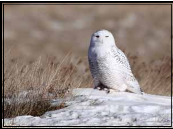
Snowy Owl. Ft. Pierre National Grasslands, 1/4/09

In December a Great Black-backed Gull and a Black-legged Kittiwake were seen at Pierre. Including a few Glaucous and Thayer's Gulls seen this winter and the overwintering of a couple California and Franklin's Gulls (a little bit of a surprise!), and the two Iceland Gulls appearing at Pierre in February, the gulls this winter were well represented. However, the overall gull numbers were down this winter at Pierre, maybe an aftereffect of the flooding last summer/fall.