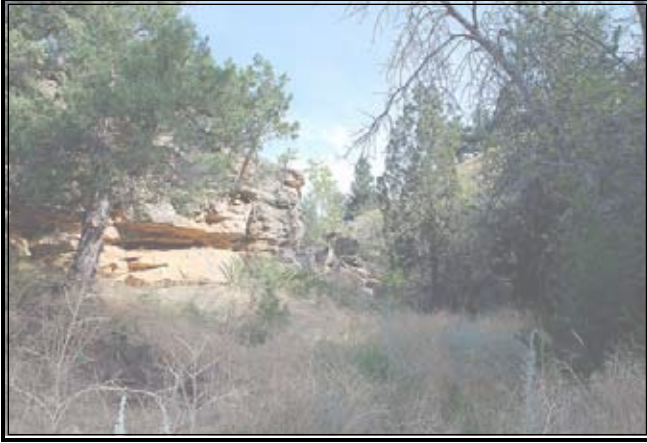
On the Sunrise Guest Ranch north of Edgemont SD

Inn, a newly renovated motel. For rates see registration form on inside mailing label.