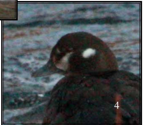
Harlequin Duck female. Canyon Lake, Rapid City, Pennington County.