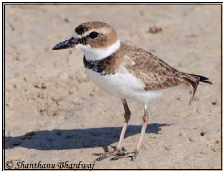
Photo Information: Photo taken by Shanthanu Bhard- waj - December 23rd, 2009 - Marco Island, Florida

Thus, I submitted a rare bird report. In November, 2013, it passed the committee. Technically, until the report has been published in SD Bird Notes , the record is not officially accepted as of this date. Our rules state that a Rare Bird becomes accepted only at the time of publication of the report.