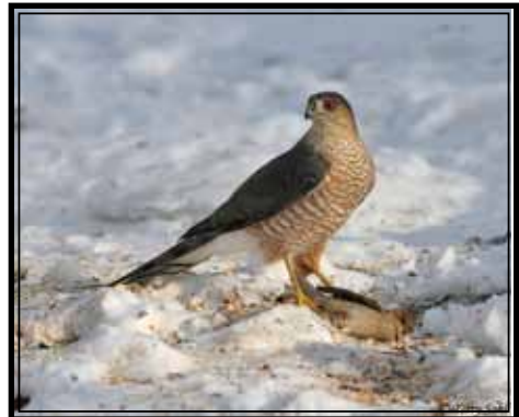
Burrowing Owl and Sharp-shinned Hawk