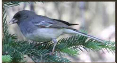
"White-winged" Junco •

Another delight was a Canyon Wren flitting from crevice to crevice on the cliff, calling its melodic, descending song. Above, we could see White-throated Swifts and the most beautiful of swallows – the Violet-Green.