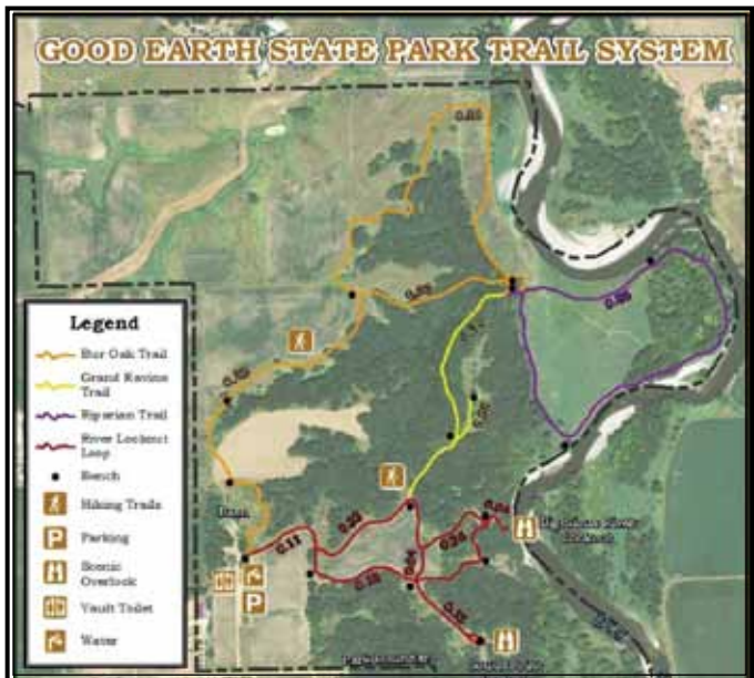
Figure 1. Good Earth State Park trail system and habitats

Survey Methods We surveyed along marked trail system routes (Figure 1): Burr Oak , Grand Ravine , River Lookout Loop , and Riparian . These trails feature woodland, woodland edge and grassland habitats. Additionally, we surveyed the outer western and