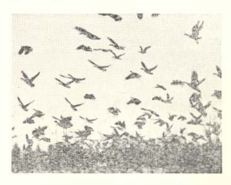
SOUTH DAKOTA BIRD NOTES

These are but the highlights of wildlife on Sand Lake, a Refuge which fed and sheltered a quarter of a million waterfowl during the past spring (1949)—a Refuge on which one may find a variety and heavy concentration of wildlife equalled in few areas in our country.