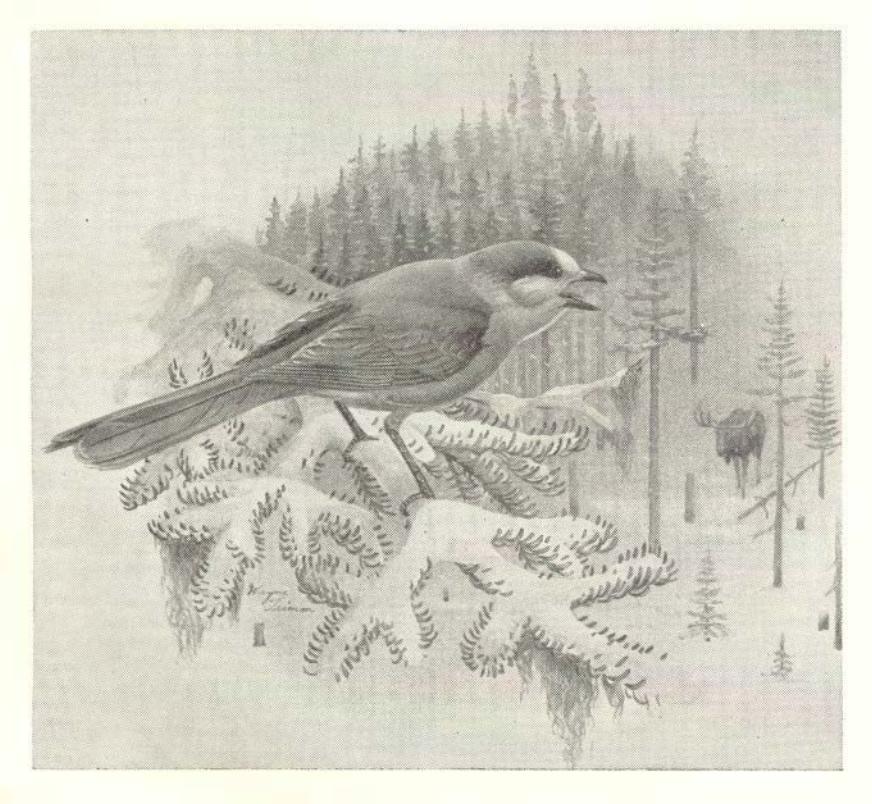
Moose-Bird Resents Moose