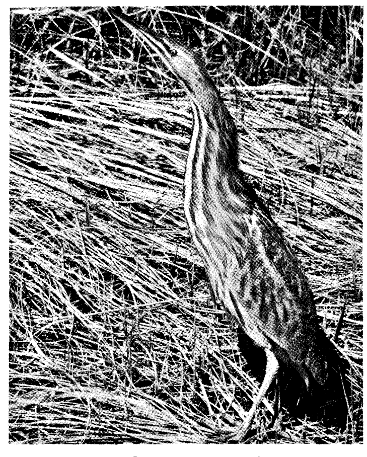
American Bittern in Pennington County