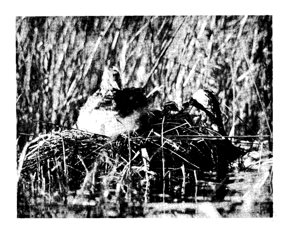
Nesting Horned Grebes in McPherson County