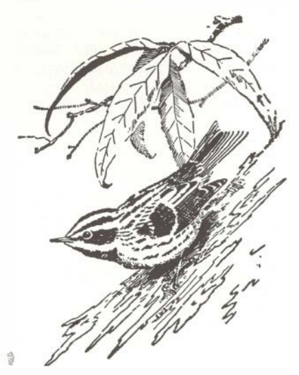
Black and White Warbler