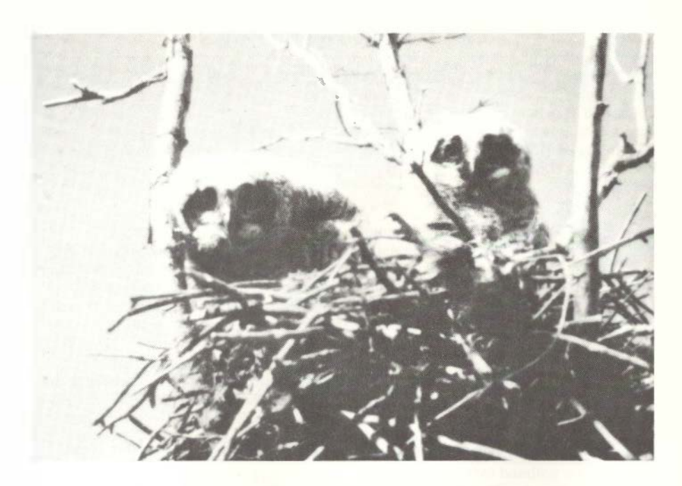
Young Great Horned Owls