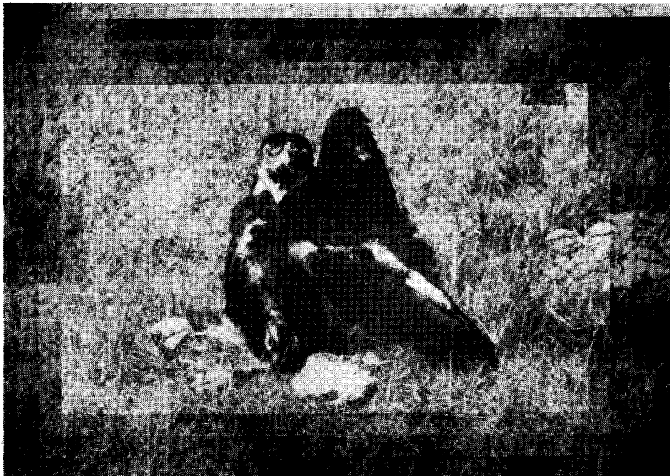
Photograph of young dark phase Ferruginous Hawk.

I searched the hillside for a nest, discovered none, but found another young bird, yet unable to fly. When I approached, it fanned its wings and hissed but was unable to stand. It was such a dark brown, it appeared black, somewhat mottled with white in the wings and tail.