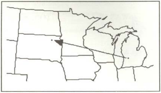
Tennessee Warblers are Figure 1. Tennessee Warbler recovery.

This is the first record of a Tennessee Warbler recovery from out of state (SDOU 1991. The Birds of South Dakota. 2nd Ed., NSU Press, Aberdeen, South Dakota). Tennessee Warbler spring migration dates for the state are from 27 April to 16 June, with peak migration occurring in the last 3 weeks of May (SDOU 1991). Tennessee Warblers are common to abundant in