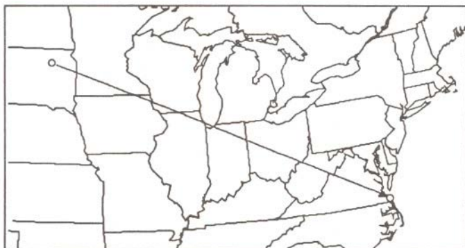
Figure 1. Common Grackle banded in Aberdeen and recovered in Virginia Beach, Virginia.

COMMON GRACKLE BANDED IN SOUTH DAKOTA RECOVERED IN VIRGINIA A Common Grackle that I banded at my backyard in Aberdeen, SD, on 14 July 1993 (1043-43721) was recovered by an unknown person at Virginia Beach, VA on 14 June 1997. This recovery is unusual because most banded grackles are recovered from Arkansas, Texas, or Louisiana and along the Mississippi valley. Two recoveries also exist from Alabama, as do single records from the panhandle of Florida and from Maryland (1991. SDOU. The Birds of South Dakota .). Although Figure 1 indicates a straight line recovery, in all probability this grackle made several migrations north and south before being recovered in Virginia.