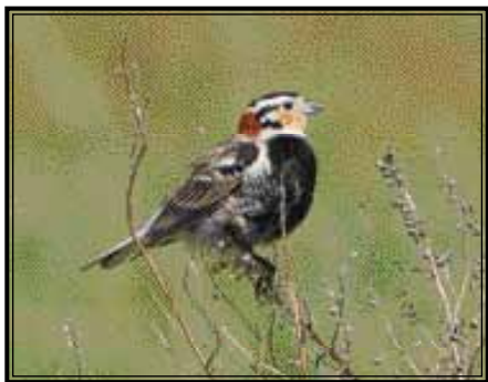
Chestnut-collared Longspurs are a summer delight on the grasslands. McPherson County, SD. 5/9/07