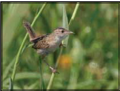
Sedge Wren chattering his peculiar song in the Nature Conservancy’s Ma-koce Washte Natural Prairie, Minnehaha County, SD. 7/28/06