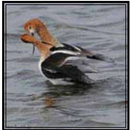
Always graceful, the beautiful American Avocet in courting ritual presents a spectacular sight.