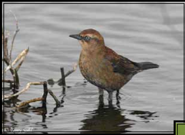
Rusty Blackbird is quite easy to identify when seen in the rusty fall plumage they are named for. In breeding plumage the subtle blackbird differences may require a better look. Lake County, SD; 10/9/06