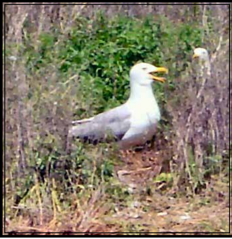
Adult Herring Gull at Nest, Hughes County.

I experienced some apprehensive excitement on this outing, as five unexpected adult Herring Gulls were also present on the large island. This inspired me to look diligently for evidence of a Herring Gull nesting. After about an hour of circling the island in the boat, to my glee, I finally spotted a sixth Herring Gull sitting on a nest.