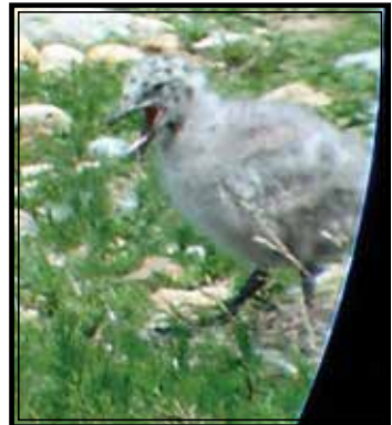
Herring Gull chick digis-coped from a rocking boat!