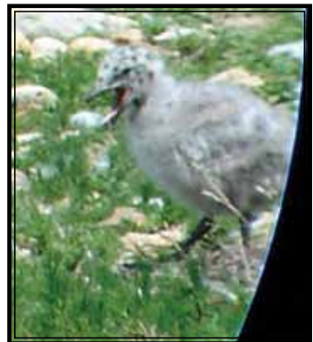
Herring Gull chick digiscoped from a rocking boat!