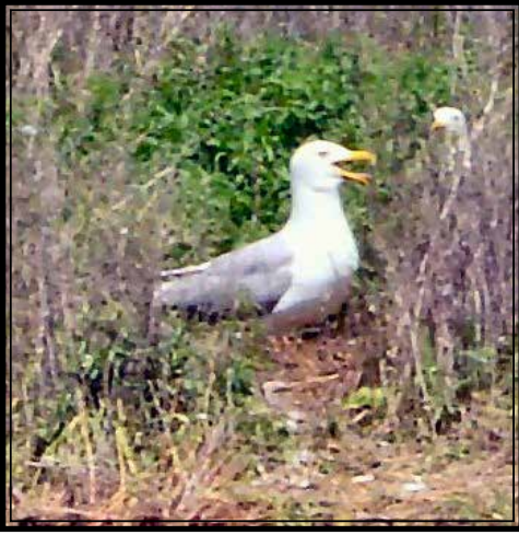
Adult Herring Gull at Nest, Hughes County.

I experienced some apprehensive excitement on this outing, as five unexpected adult Herring Gulls were also present on the large island. This inspired me to look diligently for evidence of a Herring Gull nesting. After about an hour of circling the island in the boat, to my glee, I finally spotted a sixth Herring Gull sitting on a nest.