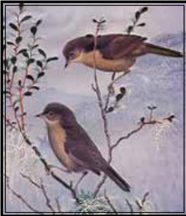
Pardusco: "Little Brown Thing."