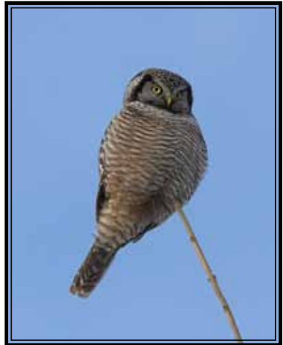
Northern Hawk Owl

The bulk of the book consists of the uniformly excellent color owl photographs. Nineteen photographers from around the world took these pictures. This is a lovely, little book that would make an excellent gift for anyone interested in birds. Despite its relatively small size, it is packed with owl information. Dan Tallman, 2120 Taylor Ct. Northfield, MN 55057.