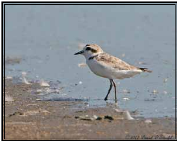
Snowy Plover at Stone Lake, Hughes Co., SD. 7/5/07

On 25 July 2007 I returned to Stone Lake once again. I observed a male with a chick about one quarter mile east of the nesting site. They were moving east along the shoreline. I followed the plovers staying about 100 yards out from the shoreline, paralleling it. I could not always see the plovers because of vegetation, so about every quarter mile I would get close to the shoreline hoping to get a picture. They were always already past me. About one and a half miles from the starting point, I proceeded to the shoreline and there was the chick out on a point wading in the water. I was able to take some pictures. They were not great because of the sun, but discernable. Finally, I had solid proof of breeding. I was very elated! I had not searched very hard for nests, because of fear that the birds would abandon their nests and leave the area. Early on I had decided that a photo of a chick was the evidence of breeding I was going to strive to attain.