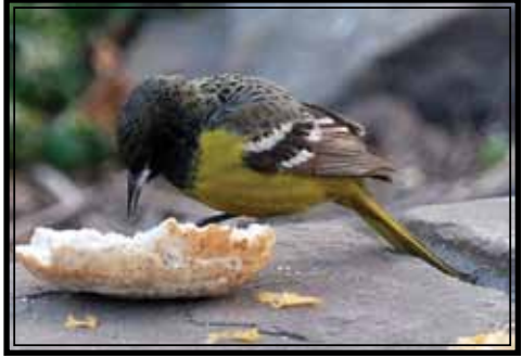
Scott's Oriole, Union Square, New York County (Manhattan), NY 01/25/08

One of the most tantalizing birding experiences I've ever had in New York City is watching birds as they migrate past the Empire State Building at night. In late September/early October, with good northwesterly winds, the lights from the building illuminate the birds as they fly by. It can be like watching a meteor shower, as the warblers, sparrows, woodpeckers, catbirds, thrushes, grosbeaks, and even herons and owls shoot by, glowing whatever color the lights happen to be that night (though this can make ID difficult). As it gets later, and more people begin to leave, you can hear the birds chipping. To enhance things even more, the local Peregrine Falcons use the light of the building to chase these songbirds, and it is quite a spectacle to see them do so.