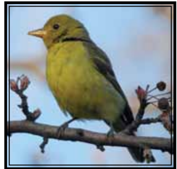
Western Tanager, Central Park, New York County (Manhattan), NY 03/29/08