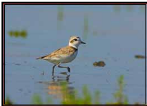
Snowy Plover at Stone Lake, Hughes Co. 6/24/06.

I decided with this many adults that the Snowy Plovers might attempt breeding. I assumed that they would behave like Piping Plovers; if I left them alone and they had successful breeding that I could return to the area in a few weeks and the family group would still be in the nesting area.