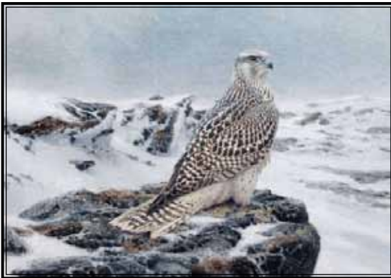
Gyrfalcon, white morph. Oil on canvas.