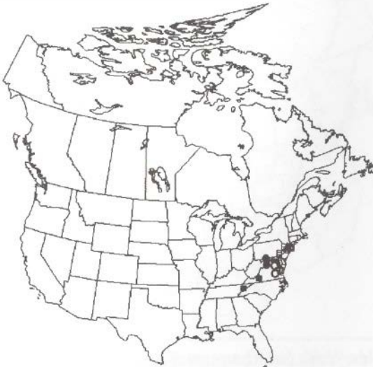
Fig. 14. Virginia (black squares), Maryland (black circles), District of Columbia (white circles), and New Jersey (white squares).