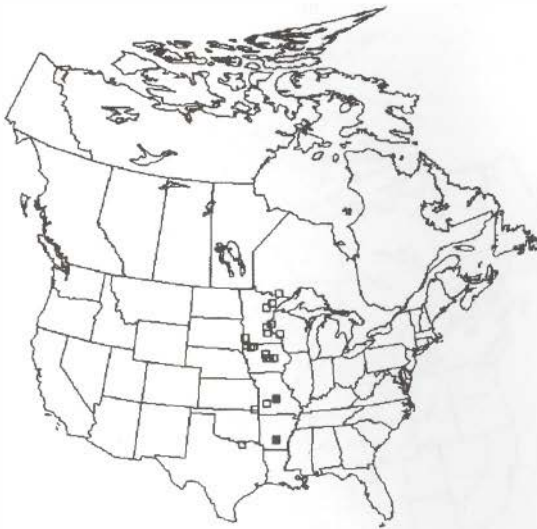
Fig. 9. Iowa (white squares) and Missouri (black