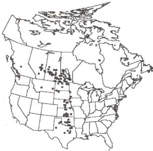
Fig. 15. Oklahoma banding recoveries.