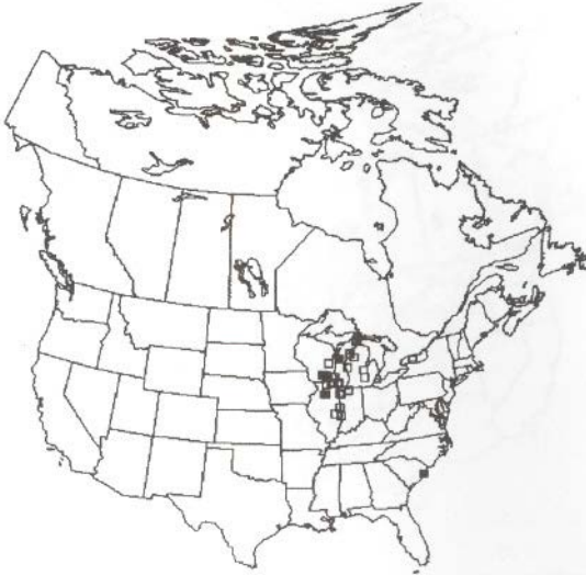
Fig. 13. Wisconsin (black squares) and Illinois (white squares).