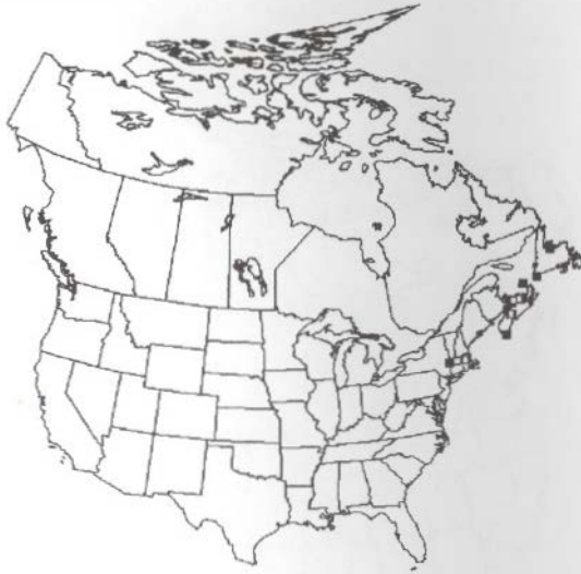
Figure 5. Prince Edward Island (white boxes) and Nova Scotia (black boxes) American Crow recoveries outside the province of banding. Sites of banding and recovery are both shown