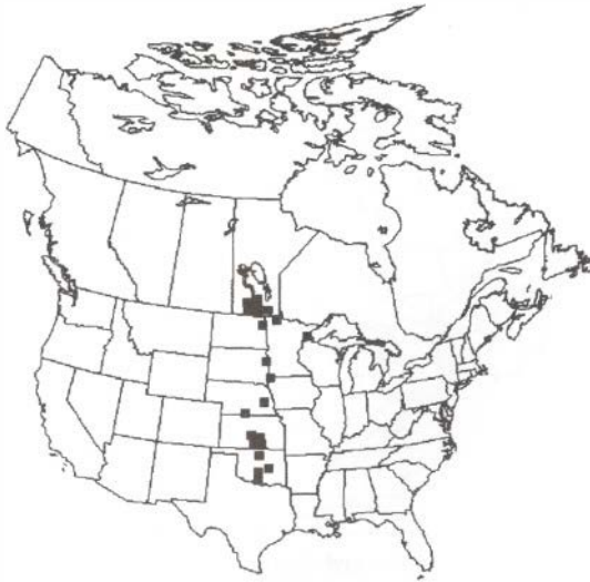
Figure 3. Manitoba American Crow recoveries outside the province of banding. Sites of banding and recovery are both shown.