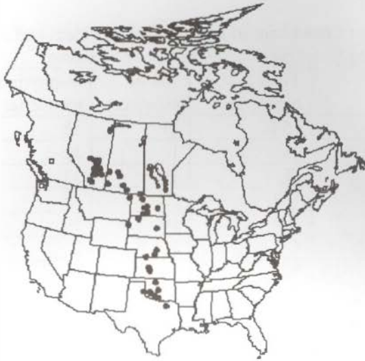
Figure 1. British Columbia (white boxes) and Alberta (black boxes) American Crow recoveries outside the province of banding. Sites of banding and recovery are both shown.