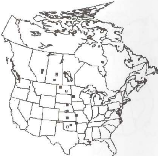
Fig. 10. Kansas (black squares) and Nebraska (white squares).