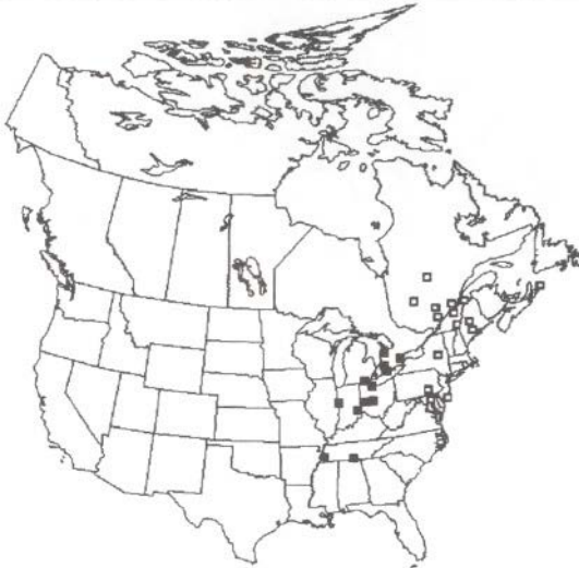
Figure 4. Quebec (white boxes) and Ontario (black boxes) American Crow recoveries outside the province of banding. Sites of banding and recovery are both shown