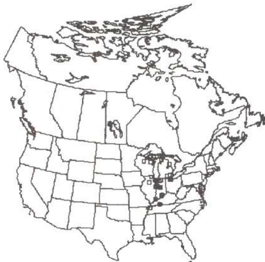
Fig 16. Michigan (white squares), Indiana (black circles), and Ohio (black squares).