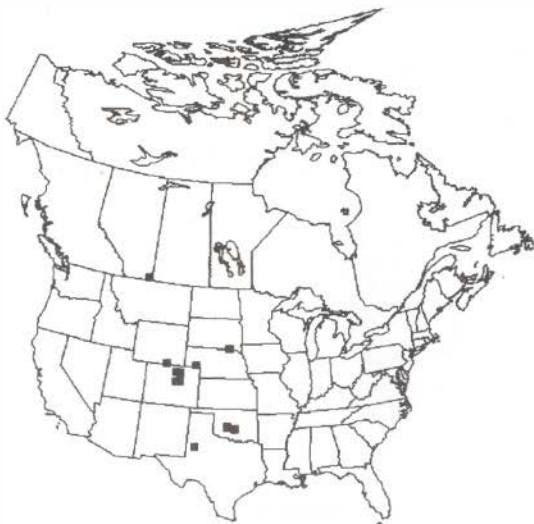
Fig. 7. Colorado banding recoveries.