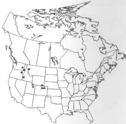
Fig. 6. Idaho (black squares), Wyoming (black triangles), and Utah (white squares).