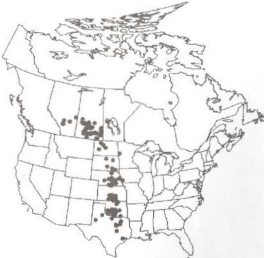
Figure 2. Saskatchewan American Crow recoveries outside the province of banding. Sites of banding and recovery are both shown.