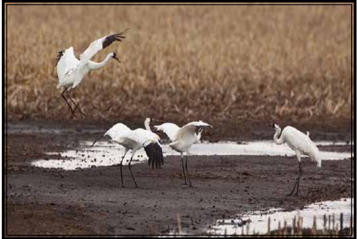
Whooping Cranes, “Dancing”