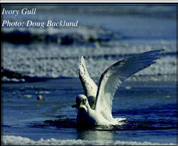
Ivory Gull

Keep your eyes open and you may be the next birder to provide additional documentation for a species new to the South Dakota checklist.