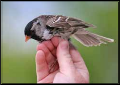
Harris's Sparrow.

developed from his observations of warblers and other birds which would not enter a trap horizontally. The traps themselves were developed under his expert, patient hands in his own workshop." With this device, where water drips into a pan and thus attracts birds that enter from the top, he caught and banded hundreds of warblers, including the Myrtle, Blackpoll, Magnolia, Yellow, Tennessee and Orange-crowned. Among less frequently occurring species, he banded the Blue-winged, Blackburnian and Black-throated Green.