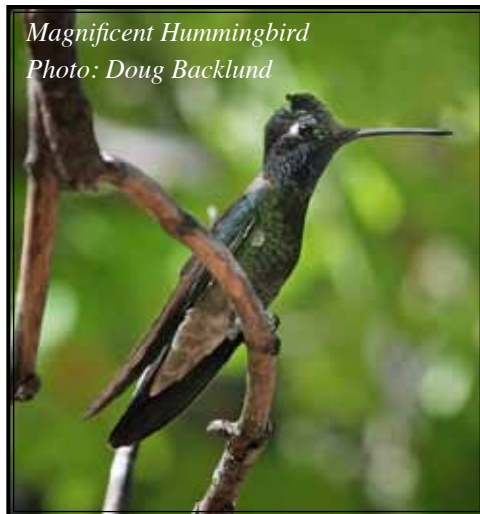
Magnificent Hummingbird

This list does not include those species accepted as Hypothetical in South Dakota (see SDBN, June 2009).