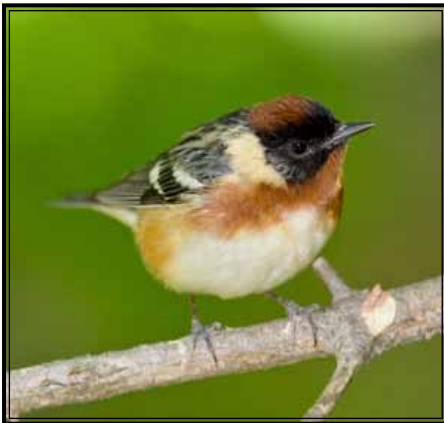
Bay-breasted Warbler, Magee Marsh, Ohio

seen in the state and were life birds for most participants. Singing Ovenbird provided the chorus for the drive through the high slopes of Newton Hills.