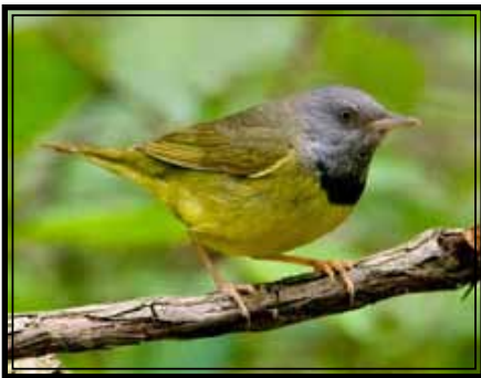
Mourning Warbler, Magee Marsh, Ohio