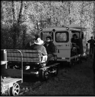
The Birding Train Caboose

territory. A pair would stand ten feet apart and “talk” to each other, no doubt making fun of the birders. Ruffed Grouse called in the background as Eastern Bluebirds landed all around us. When a loud, tinny sound erupted, a binocular investigation showed it to be a Yellow-bellied Sapsucker drumming on a metal fence to impress a mate, or maybe to impress birders. Singing in the trees was a Warbling Vireo, and squawking behind us was a Pileated Woodpecker.