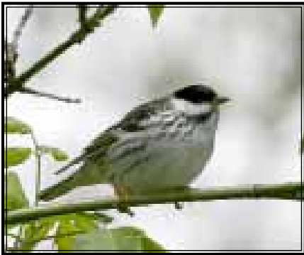
Blackpoll Warbler