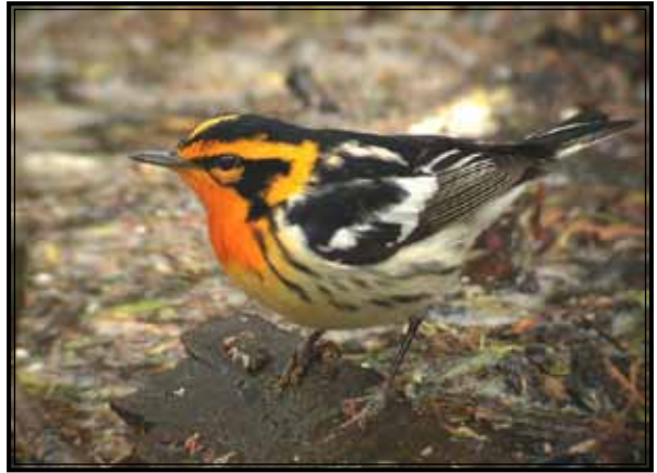
Blackburnian Warbler, South Padre Island, Texas.