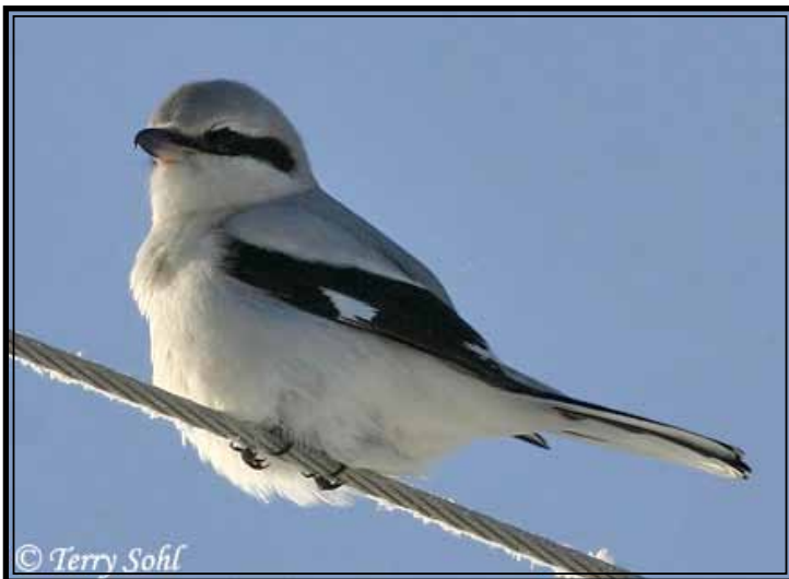
Northern Shrike