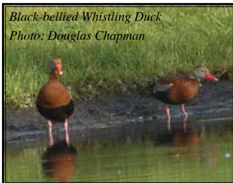
Black-bellied Whistling Duck

This list does not include those species accepted as Hypothetical in South Dakota (see SDBN, June 2009).