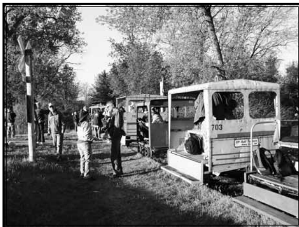
The Birding Train at a Stop

We were informed that the train would travel at about ten mph. Thus, it can make numerous stops, allowing birders to hike to specific hot spots, including prairie areas, marshes, and wooded areas. We were told to expect a minimum of forty species, which we exceeded. Each stop had different species and beautiful scenery. At our first marsh spot, we found nesting Sandhill Cranes, our major target bird. Each pair was nesting quite far apart, and would sound very loud calls when something entered their