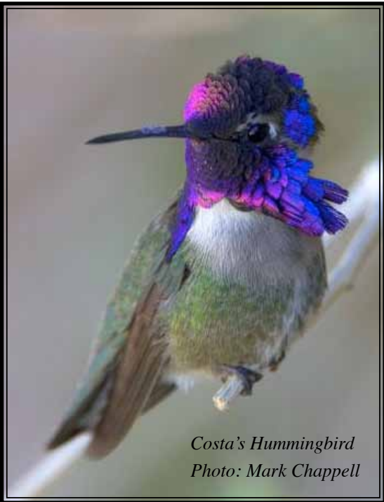
Costa's Hummingbird