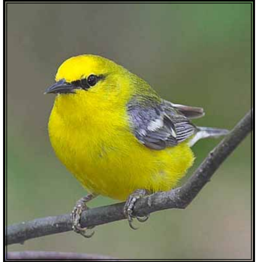
Blue-winged Warbler, Central Park, NYC

Doug Chapman led a third group to Newton Hills State Park, with a stop at a pre-scouted flooded field. At this field, participants were treated to very good looks at shorebirds, including Hudsonian Godwit (11), White-rumped (35), Least (21), Baird's (1) and Pectoral (42) sandpipers and resplendent breeding-plumaged Dunlin (13). A lone Semipalmated Plover was among the many Killdeer feeding. Once we arrived at Newton Hills State Park, we heard Yellow-throated Vireo, and then saw them very well. Baltimore Oriole, Great Crested Flycatcher, Eastern Wood-Pewee, Indigo Bunting and Rose-breasted Grosbeak sang from nearly every available tree or shrub. Warblers were the main targets and did not disappoint! Over forty Tennessee Warbler and over forty American Redstart were seen and heard! An American Redstart nest was found by Kenny Miller and Mark Otnes right on the Sargeant Creek Trail. Five Blue-winged Warblers were seen and heard—the largest number of this rare South Dakota species