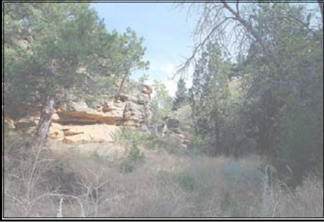
On the Sunrise Guest Ranch north of Edgemont SD

Inn, a newly renovated motel. For rates see registration form on inside mailing label.