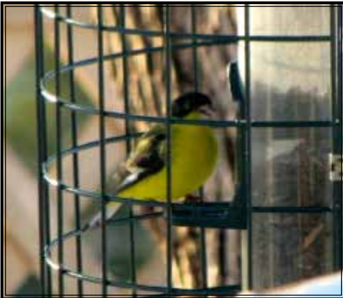
Lesser Goldfinch 01/14/13 Pennington County