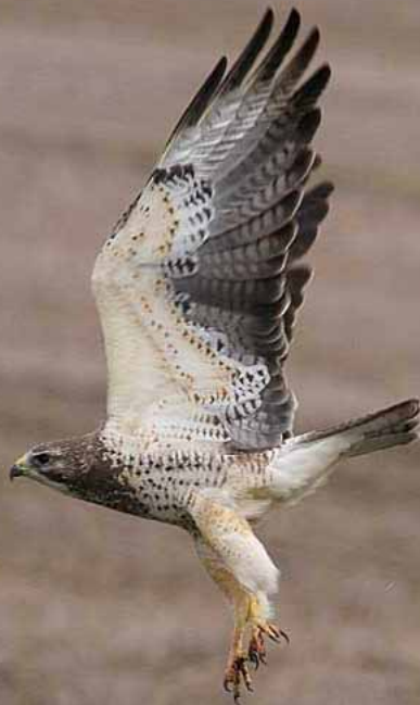
Swainson's Hawk in flight 04/30/2005, Lake Thompson, Kingsbury County

One large ferruginous I watched, caught and consumed five small mice in just under two minutes using this method.