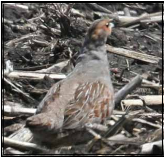
Gray Partridge, 10/14/08 Lincoln County

This year, 2013, opened with a flock of 15 Gray Partridge walking through my snow-covered yard on 1 January. As this species becomes a permanent resident at my place, the challenge for me is in learning how to carry on my necessary tasks here while allowing their successful nesting to continue.