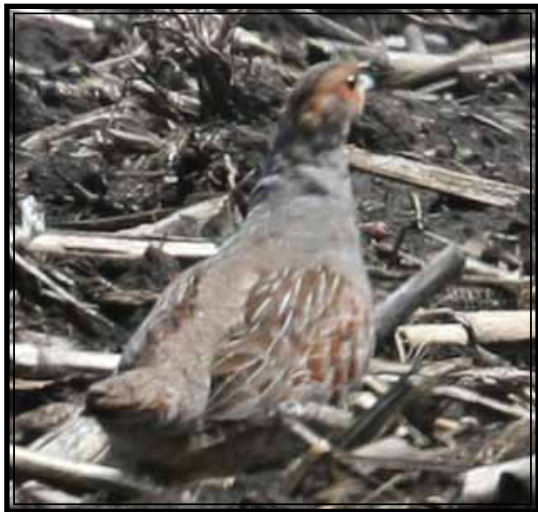
Gray Partridge, 10/14/08 Lincoln County

This year, 2013, opened with a flock of 15 Gray Partridge walking through my snow-covered yard on 1 January. As this species becomes a permanent resident at my place, the challenge for me is in learning how to carry on my necessary tasks here while allowing their successful nesting to continue.