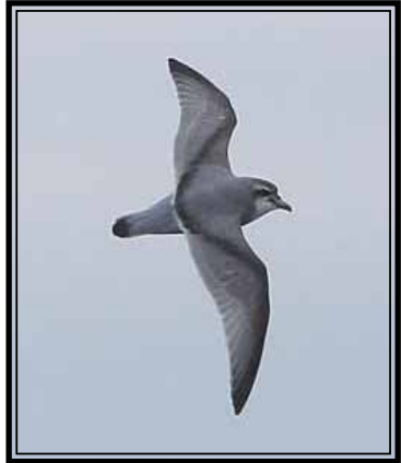
Antarctic Prion South Atlantic Ocean, 02/2008

That said, for some of us the brief views (pelagic sightings are overwhelmingly brief) of a Bermuda Petrel, or two Greater Shearwaters diving furiously, or the Fork-tailed Storm-Petrel dashing by like a mini kamikaze cannot be beat for the experience and the joy of a completely different world of birding. Vastly different from South Dakota.