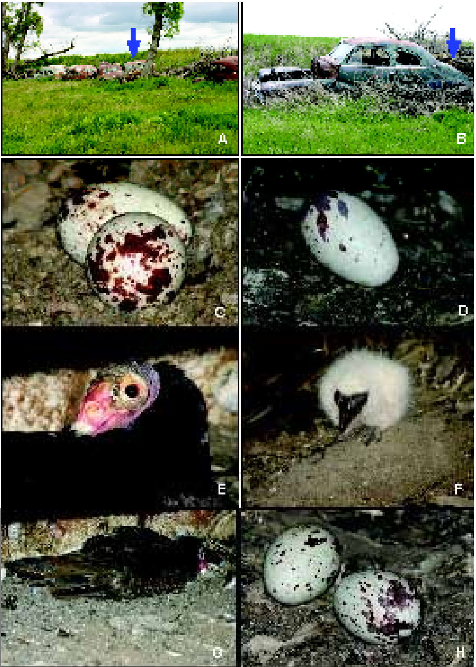
Figure 2. Turkey Vulture nest site in Butte County. A) Row of 1940s era sedans (arrow indicates vehicle with vulture nest from 2007–2012); B) Chevrolet Fleetmaster (arrow indicates location of vulture nest in vehicle's luggage compartment); C) Two vulture eggs on 31 May 2007; D) Vulture egg on 30 May 2008 (egg was unusually elongated with a blunt end; the second egg is not pictured but was broken); E) Adult vulture on nest on 4 June 2010; F) Vulture chick (about six days old) on 4 June 2010; G) Adult vulture on nest on 31 May 2011; H) Two vulture eggs on 31 May 2012.