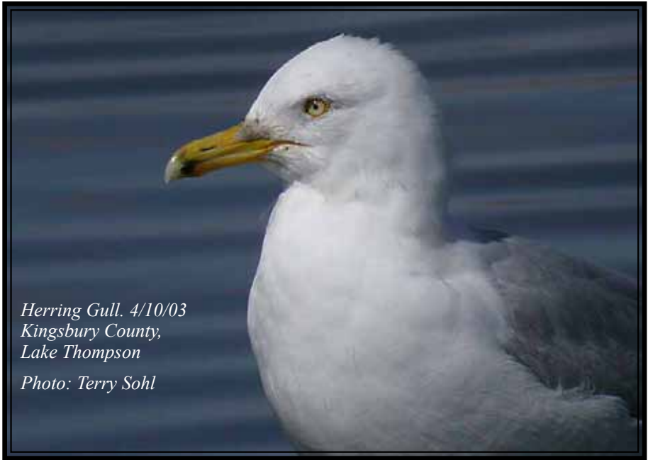
Herring Gull. 4/10/03 Kingsbury County, Lake Thompson