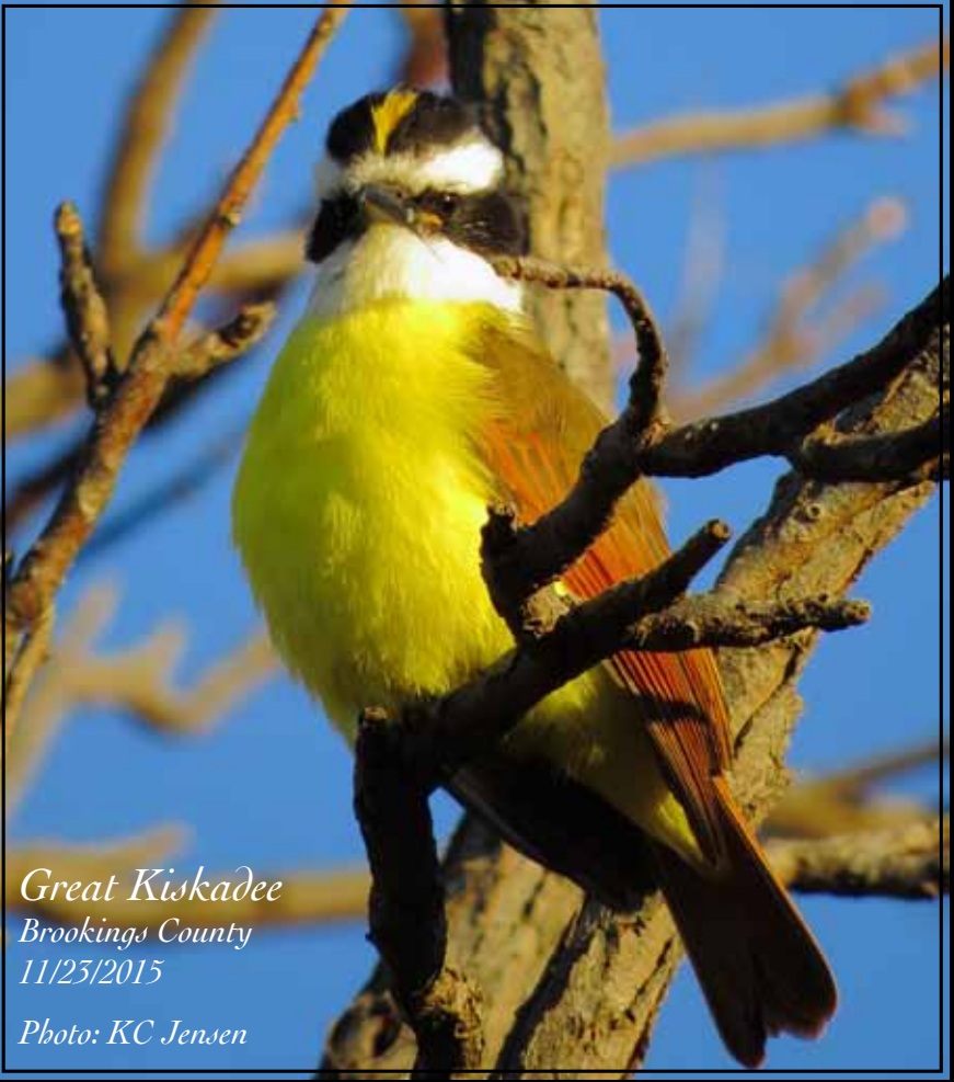
Great Kiskadee Brookings County 11/23/2015