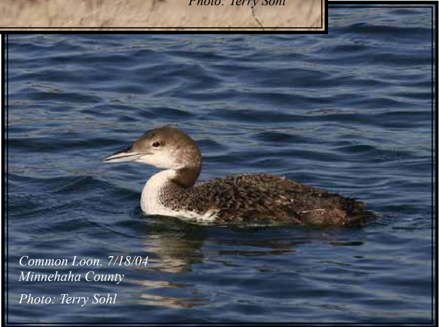
Common Loon. 7/18/04 Minnehaha County