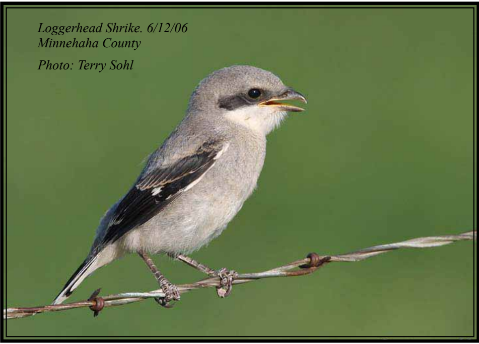
Loggerhead Shrike. 6/12/06 Minnehaha County