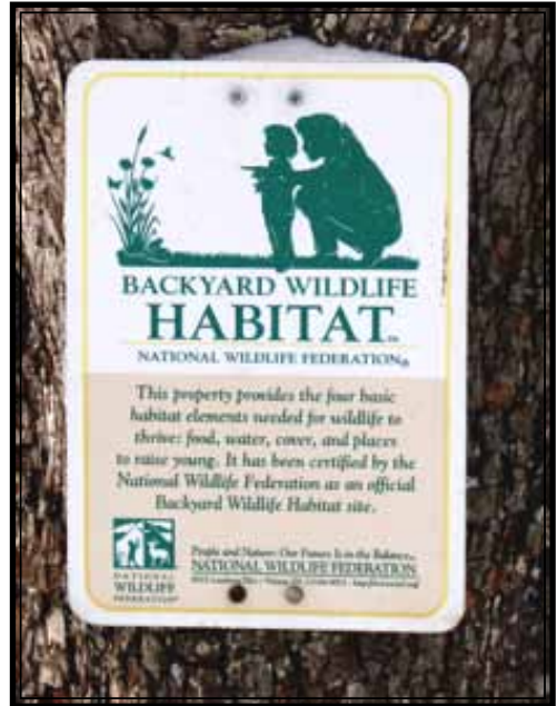
National Wildlife Federation Backyard Wildlife Habitat signage is available for those who qualify

In this southeastern South Dakota, most yards in the urban forest have some green stuff. Including trees, flowers, shrubs, and more than not, non-native grasses, (cut short). Yard gardens, either food or flower, are increasing. If minimal or no chemicals are used, these yards can be bird friendly.