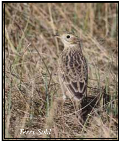
B. Sprague's Pipit adult. Jones Co. 9/25/11.