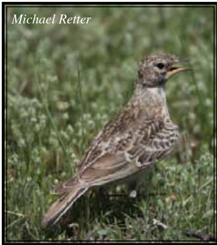
A. Horned Lark in "juvenile" plumage. Butte Co. 6/18/15.