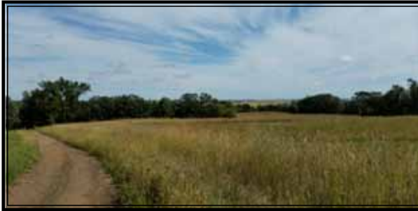
Good Earth State Park prairie near the parking lot

Good Earth's 529 acres are located about 10 miles southeast of Sioux Falls, along the Big Sioux River and South Dakota-Iowa border. Good Earth is easily accessible and has facilities for hiking and birding. Currently, construction has started on a Visitor Center and an alternate entrance.