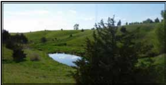
Figure 2. Good Earth State Park northern grasslands and small pond