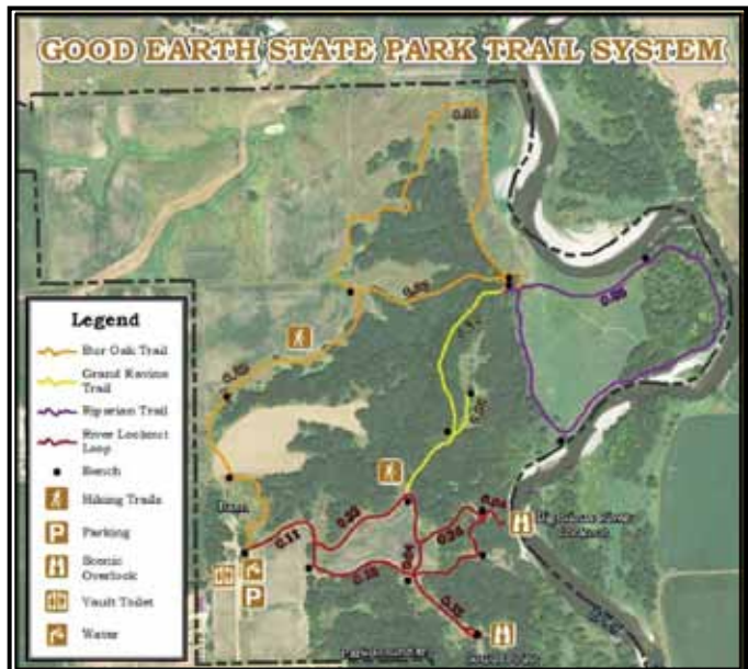
Figure 1. Good Earth State Park trail system and habitats

Survey Methods We surveyed along marked trail system routes (Figure 1): Burr Oak , Grand Ravine , River Lookout Loop , and Riparian . These trails feature woodland, woodland edge and grassland habitats. Additionally, we surveyed the outer western and