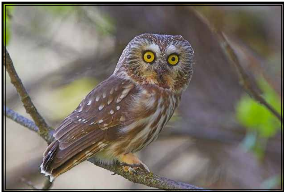
Northern Saw-whet Owl in the Cave Hills of Harding County, South Dakota