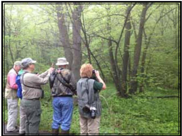
Looking for Veery in Mysterious Sica Hollow

The SDOU Fall 2014 Meeting will be held in Vermillion, SD, 3-5 October, 2014. The 66th Annual SDOU Spring 2015 Meeting will be in Spearfish. More details will be available in the upcoming months.