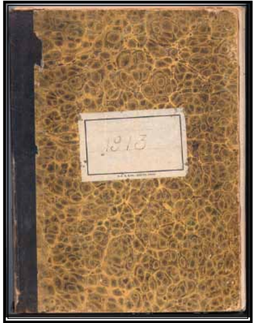
1913 Journal – cover