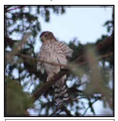
Cooper's Hawk, McKennan Park, Sioux Falls

(Later on I discovered the National Audubon Society and eBird.)