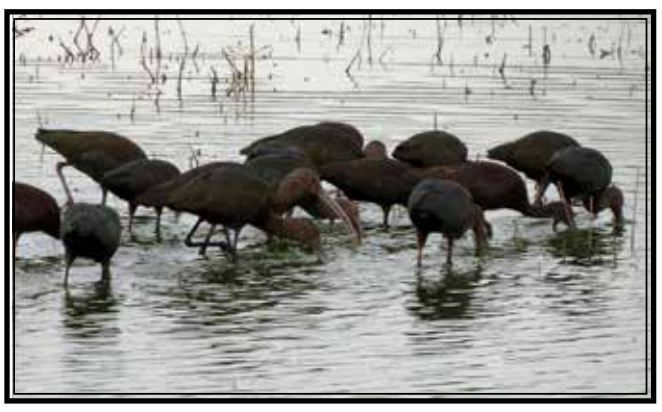
Ibis Feeding at LANWR August 29, 2016

LANWR has a nice variety of birds that either migrate through or are resident in the area. Highlights include Whooping Crane, Sandhill Crane, Greater Prairie-Chicken. Sharptailed Grouse, Northern Bobwhite, Tundra Swan, Golden Eagle, Piping Plover and many more. At times there are huge flocks of Western Meadowlark, Bobolink and different species of sparrows. Recently I photographed a Sage Thrasher there (rare for that area). This year I have seen quite a few Lark Buntings. Waterfowl migra-