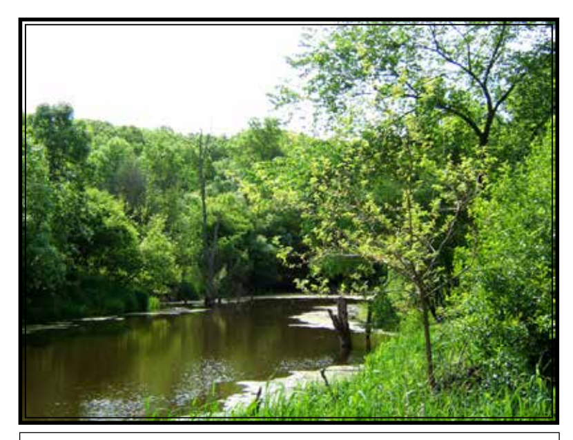
Great Bear Recreation Area

For driving directions to these parks, and access to maps, go to <www.siouxfalls.org/contactus/parks/public-parks>