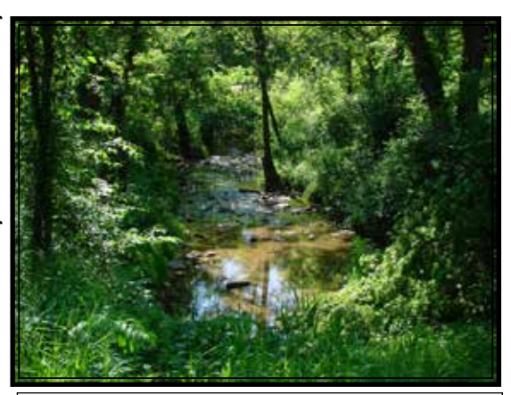
Perry Nature Reserve

Arrowhead Park, just east of Sioux Falls, lies alongside the Arrowhead Expressway across from the Perry Nature Area, the Mary Jo Wegner Arboretum and historic East Sioux Falls. The park has maps of the trails available. The area consists of restored grasslands, some woodland and old quarries that have filled with water. Trails go along the quarried ponds as well as the grasslands and forest area on the east side