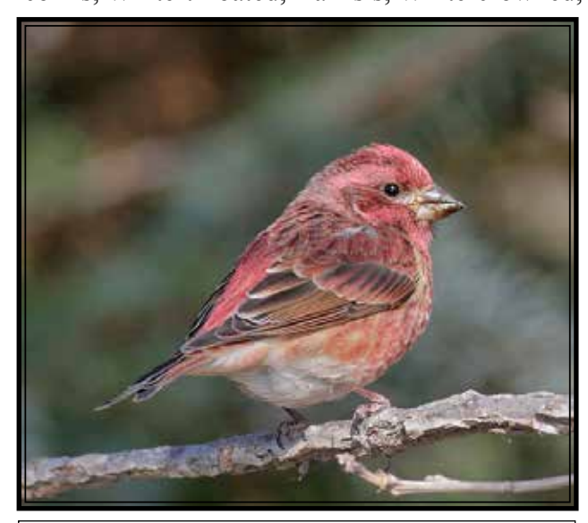
Purple Finch

American Tree Sparrows and Dark-eyed Junco observed. Meanwhile summertime breeders such as Eastern Wood-Pewee, Yellow-bellied Sapsucker, Scarlet Tanager, Great-Flycatcher, crested Indigo Bunting, Bluegray Gnatcatcher, East-Bluebird, Roseern breasted Grosbeak and Yellow Warbler have been seen here. While birding along trails keep a lookout for Pile-