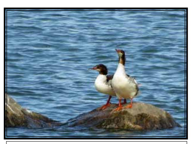
Common Mergansers at Lake Andes National Wildlife Refuge

My days of birding at the Lake Andes National Wildlife Refuge have provided me impressive information about birds and their behaviors. I recommend that all people serious about birds find a good birding area nearby and visit it — often. It is really quite interesting to watch a habitat changing in a matter of years and how that affects birds. It is also interesting to notice which birds visit an area and at what times of the year certain birds show up. Comparing these seasonal statistics to previous years gives some insight on the trends and habits of birds. Find a birding patch near you and see what you discover!