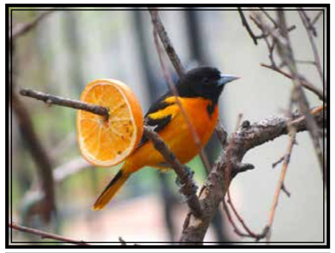
Baltimore Orioles Are Always a Welcome Yard Ornament

There are thousands of yard birders in South Dakota, many very good at