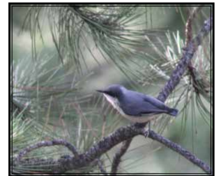
Pygmy Nuthatch, Near Custer, SD

I have always been interested in animals. As a younger kid I refused to wear a shirt without an animal on it. As I got older, I started to identify some animals and a few plants. I knew lots of the basic birds: Red-tailed Hawk, American Robin, Northern Cardinal, Blue Jay, and so on. Then, for my eleventh birthday, I got that bird guide of the Dakotas. It was a good starter guide, but I started to see birds that were not in my book and I was very confused (spring migration was really hard for me.) When I discovered Cornell Lab of Ornithology, I was amazed at how many more birds there were out there. And...I could listen to sounds now! This took my birding skills to a new level