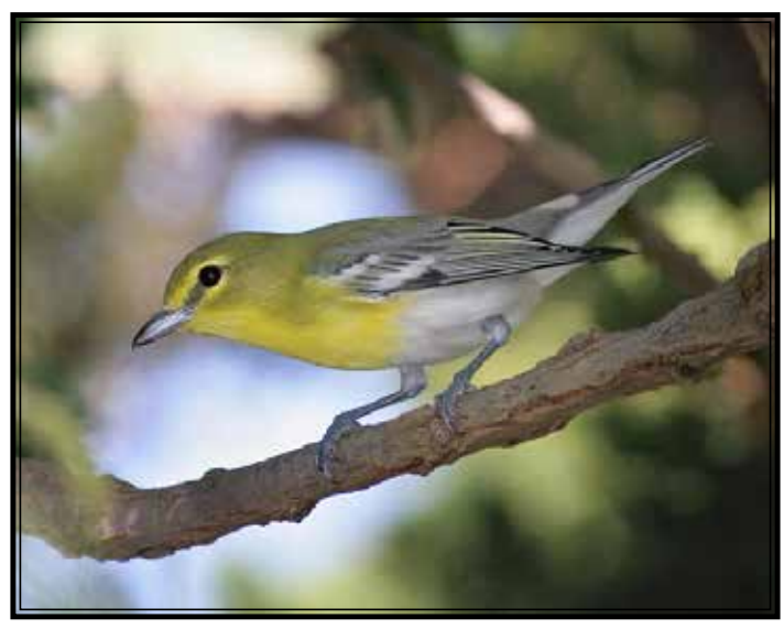
Yellow-throated Vireo

ern edge of the city, is another very good park to bird. It is 220 acres and has four miles of trails. However, in the winter time it is a winter recreational park so birding is easier in spring, summer and fall. Note there is an archery area on the northeast side which is off limits for the summer. The habitat is, in large part, Burr Oak forest with upland prairie on top of the hills, giving it a mosaic of eastern deciduous forest meeting grassland steppe.