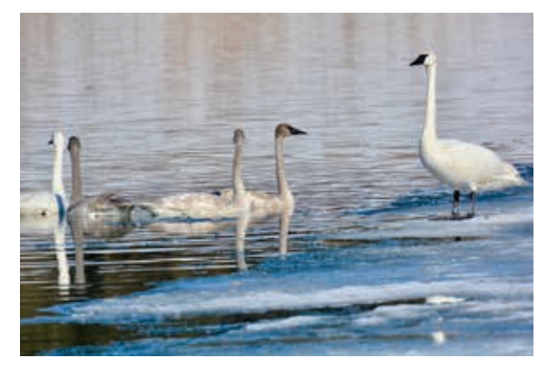
Trumpeter Swans, Lake Yankton, January 29, 2024.