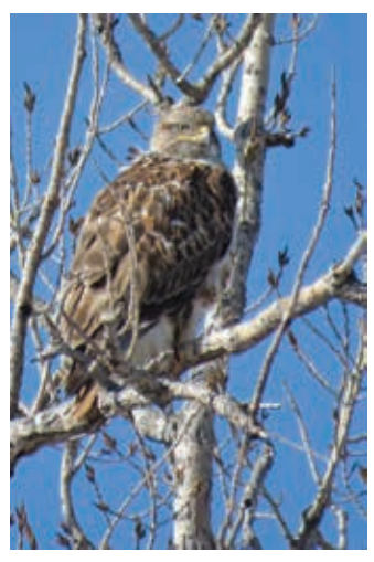
Ferruginous Hawk, Silver Lake, Hutchinson County.