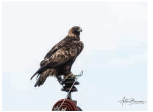
Golden Eagle, western South Dakota, February 7, 2024.