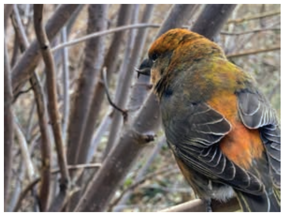
Red Crossbill, Good Earth State Park, December 26, 2023.