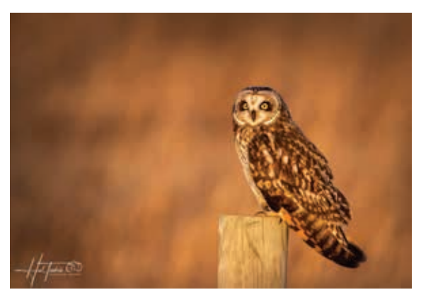
Short-eared Owl, Grant County, February 15, 2024.