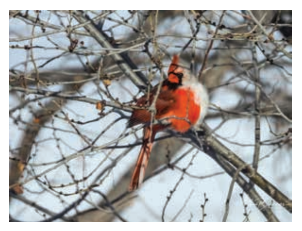
Northern Cardinal (Gyandromorph), Pierre, January 24, 2024.