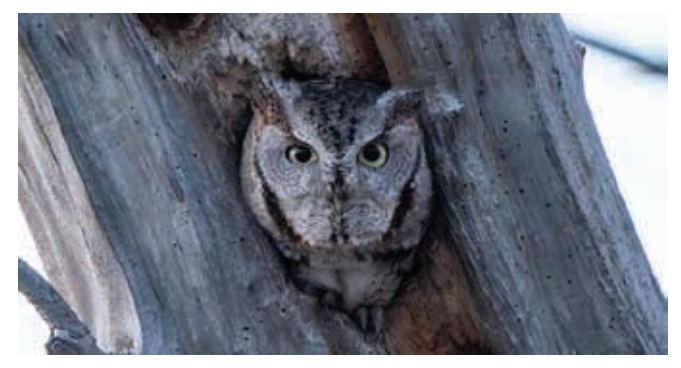
Eastern Screech-Owl, Codington County, February 25, 2024.