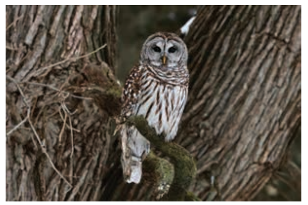
Barred Owl, Yankton County, January 3, 2024.