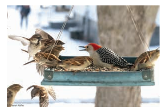
Red-bellied Woodpecker, Yankton, February 16, 2024.