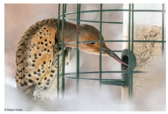
Northern Flicker, Yankton, January 15, 2024.