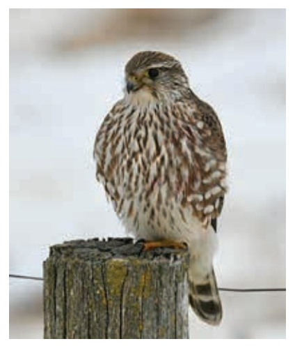
Merlin, Brookings, January 23, 2024.