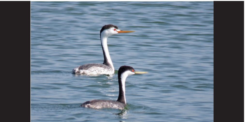
Clark's and Western grebes, Lake Andes NWR, Sept. 15, 2024.