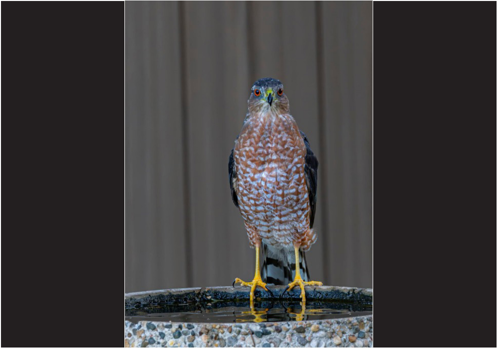
Cooper's Hawk, Sioux Falls, Sept. 7, 2024.