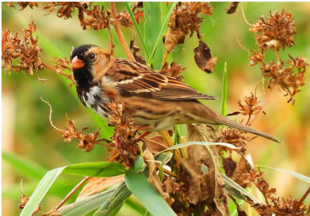
Harris's Sparrow, Dewey Gevik Nature Area, Oct. 14, 2024.