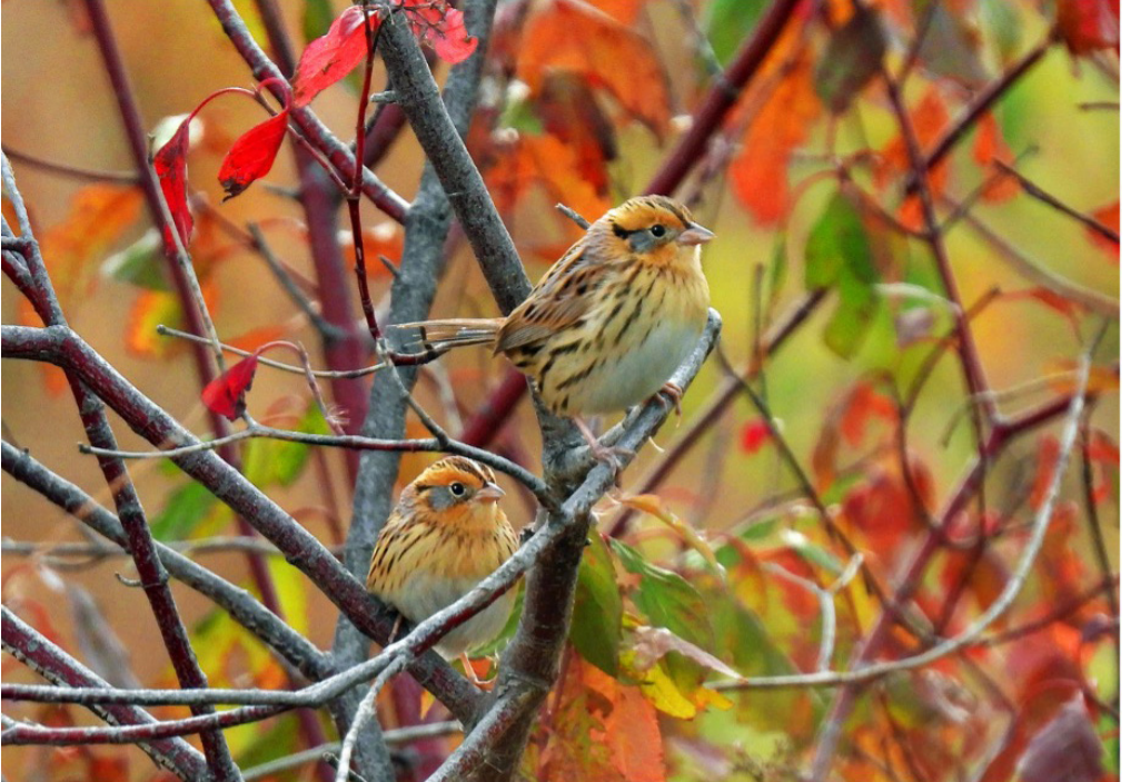
LeConte's Sparrows, Dewey Gevik Nature Area, October 19, 2024.