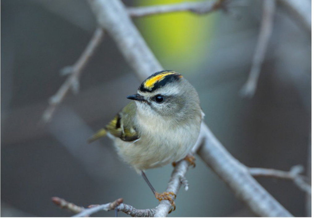
Golden-crowned Kinglet, Pickeral Lake, Nov. 16, 2024.