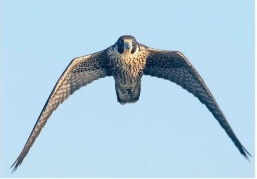
Peregrine Falcon, Pierre area, Fall 2024.