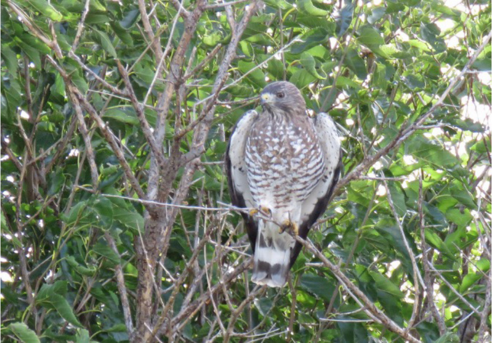
Broad-winged Hawk, Lake Andes NWR, Sept. 22, 2024.