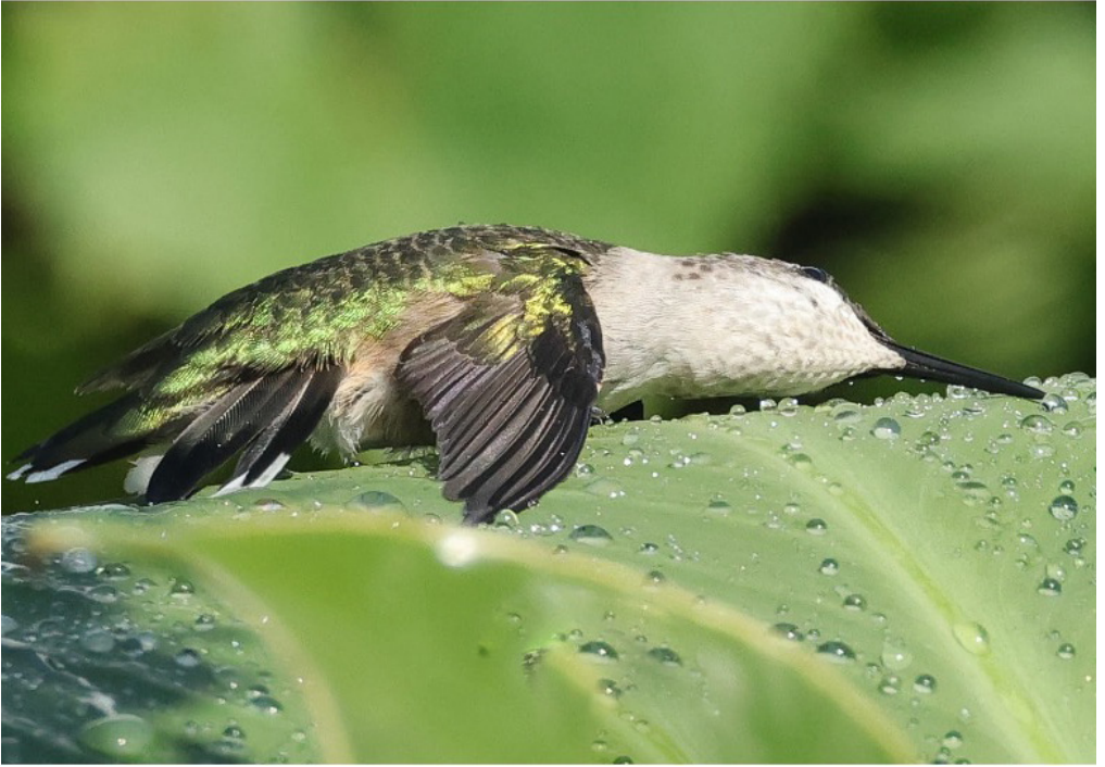
Ruby-throated Hummingbird, Brookings, Aug. 25, 2024.