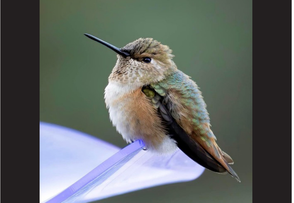
Rufous Hummingbird, Mitchell, Sept. 17, 2024.