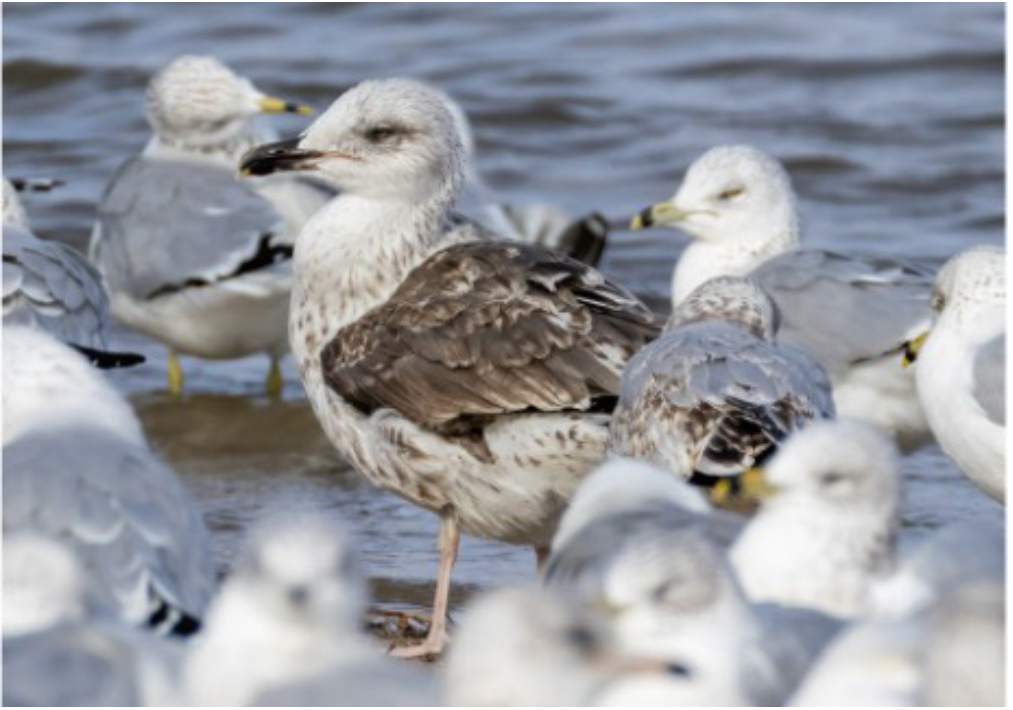
Lesser Black-backed Gull among Ring-billed Gulls, Lake Yankton. Nov. 11, 2024.