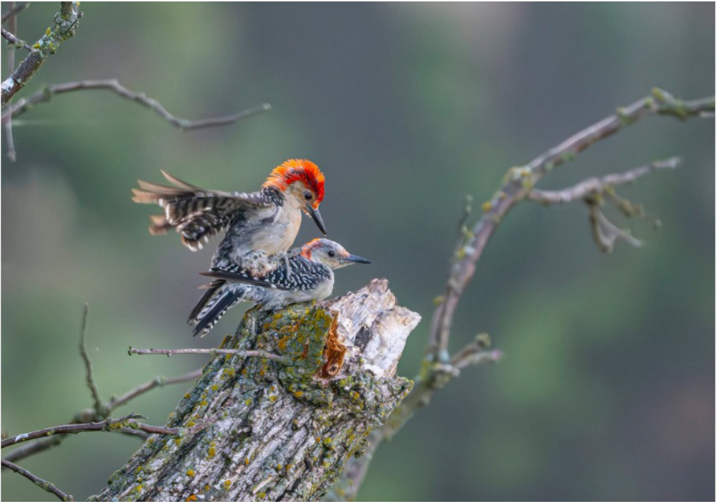
Red-bellied Woodpeckers, Good Earth State Park, Aug. 3, 2024.