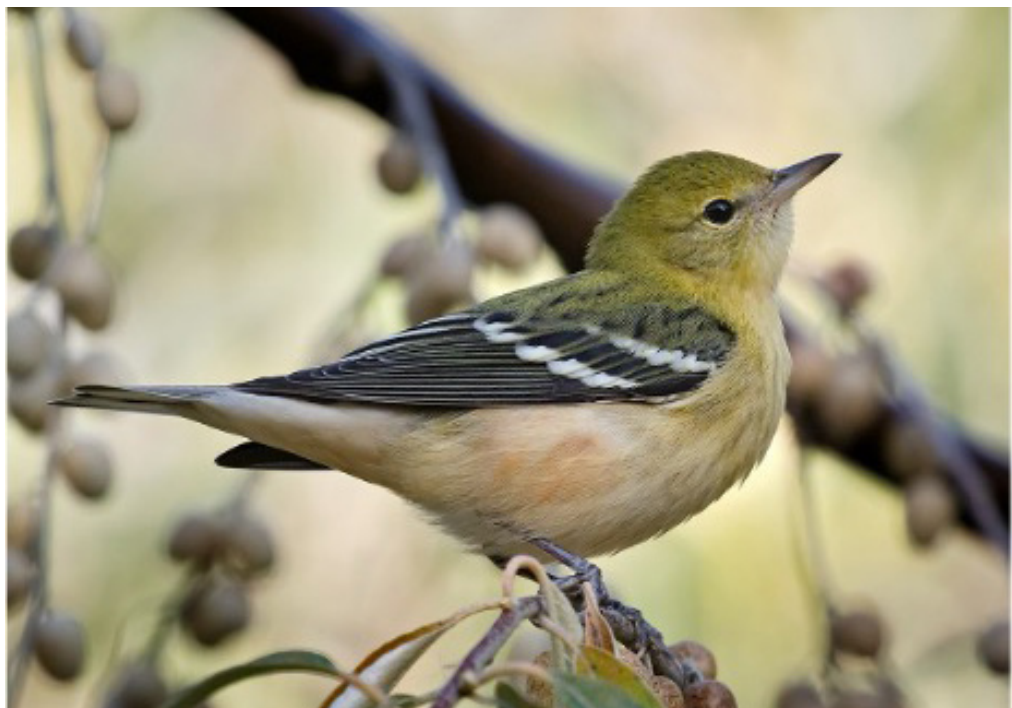
Bay-breasted Warbler, Pierre area, Fall 2024.