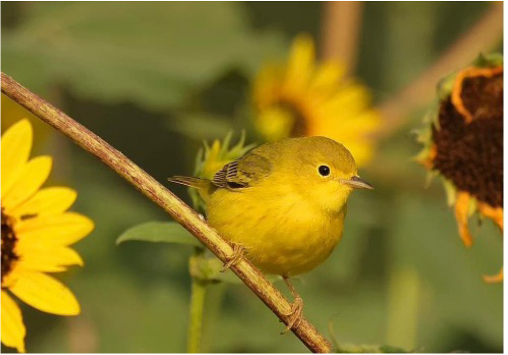
Yellow Warbler, Springfield area, Aug. 16, 2024.