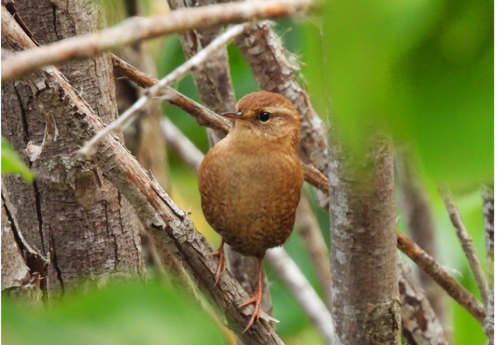
Winter Wren, Dewey Gevik Nature Area, Oct. 14, 2024.