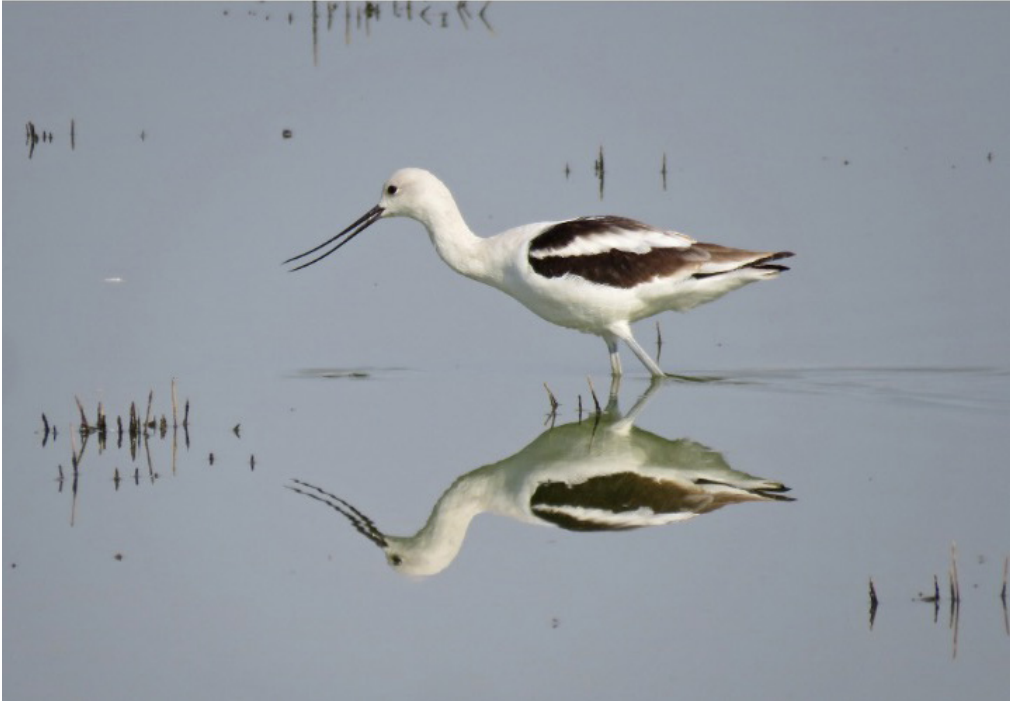
American Avocet, Lake Andes NWR, October 12, 2024.