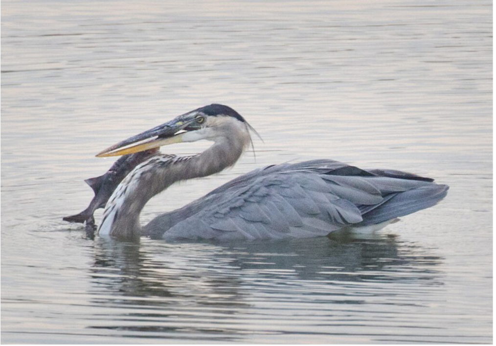
Great Blue Heron with fish, Hipple Lake, Hughes County, Sept. 6, 2024.