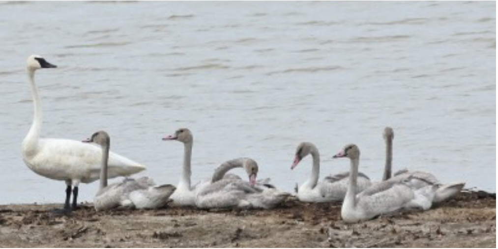
Trumpeter Swan brood, Slim Buttes, Harding County, Aug. 19, 2024.

In addition to our front and back cover photos of this season's rarities, the following are a selection of photos taken in South Dakota during fall 2024. All photos reproduced with permission of the photographers.