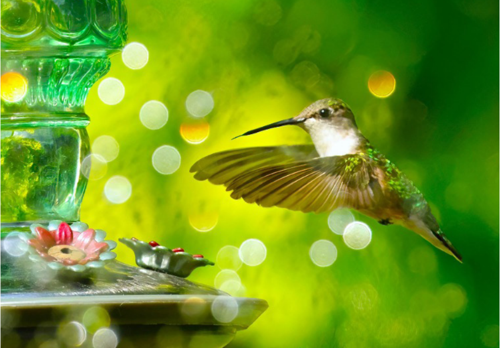
Ruby-throated Hummingbird, Sioux Falls, Aug. 7, 2024.