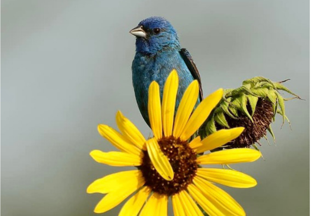
Indigo Bunting, Springfield area, Aug. 16, 2024.